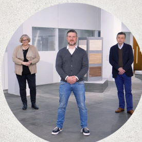
Fascination Surfaces – Feel an Function

Tuesday, May 4 | 02:40 pm CET | interzum @home