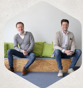
Closer to Nature

Wednesday, May 5 | 09:40 am CET | interzum @home